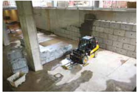
4988 one tonne blocks of reinforced concrete have been used to form the walls of the radiotherapy treatment rooms; this ensures no one outside of the room is exposed to the radiation.

Best wishes, Liz Bishop, Chief Executive