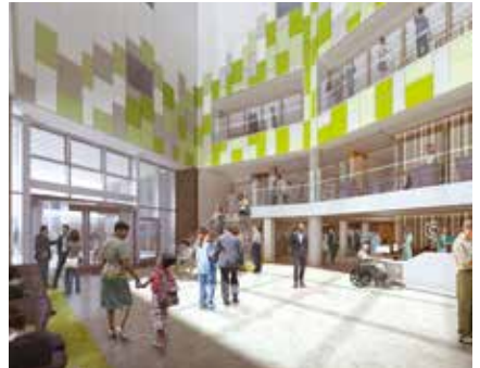
The radiotherapy department on the ground floor opens onto a winter garden offering patients an outdoor space; the internal atrium helps flood this department with natural light.